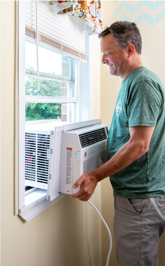
Removing any window AC unit for the winter months prevents heat from escaping your home and wasting energy. Add this to your annual fall winterizing chore list to help save money.