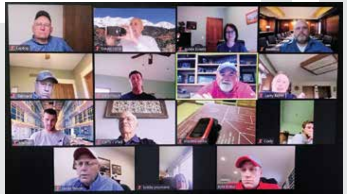
Virtual board meetings became part of the co-op's new normal in 2020.